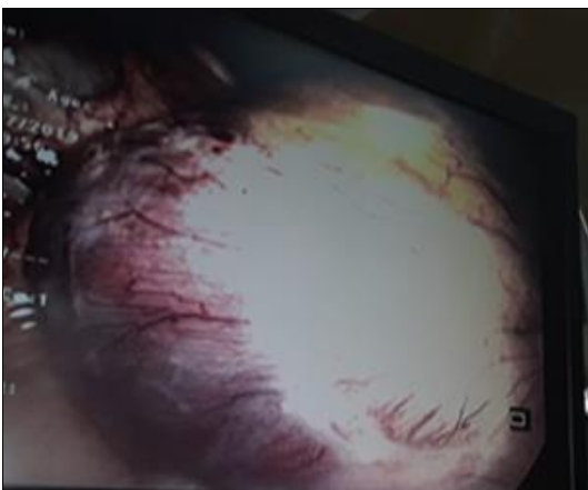
Fig 3: Laparoscopic management of Simple Ovarian Cyst