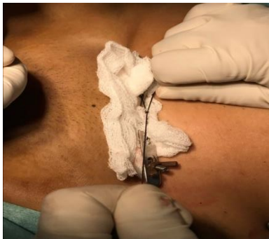
Fig 7: Silk thread fixing into traction device