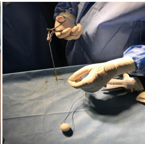
Fig. 2: Silk thread fed into olive head needle