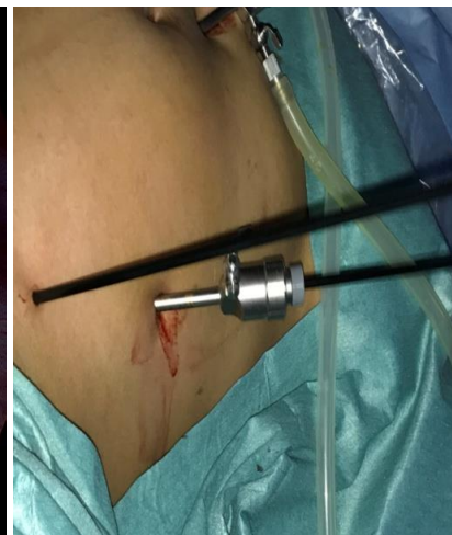
Fig 4: Stab incision adjacent to the lateral port